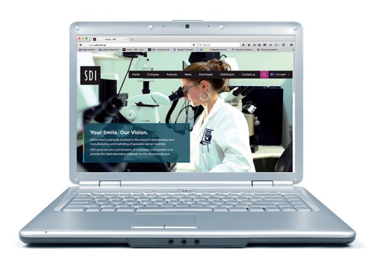
CUSTOMISABLE MARKETING MATERIAL More customisable marketing material is available via download. Visit: www.sdi.com.au