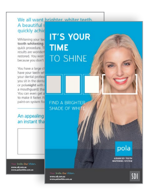
POLA STATEMENT STUFFER Reorder M100291