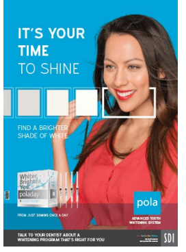
POSTER POLADAY Reorder M100274