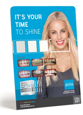
POLA BEFORE & AFTER STAND Reorder M100288