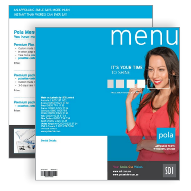
POLA MENU Reorder M100292