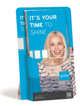
POLA PATIENT HANDOUT STAND Reorder M100290