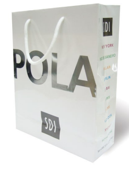
POLA CARRY BAG Reorder M100143