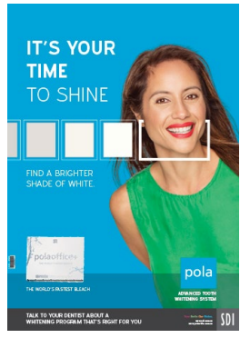
POSTER POLAOFFICE+ Reorder M100276