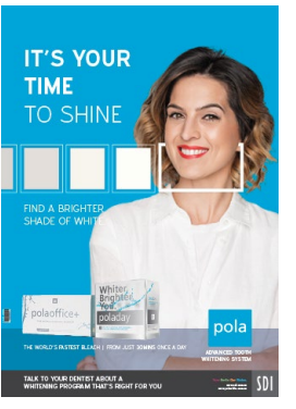
POSTER POLAOFFICE+ AND POLADAY Reorder M100279