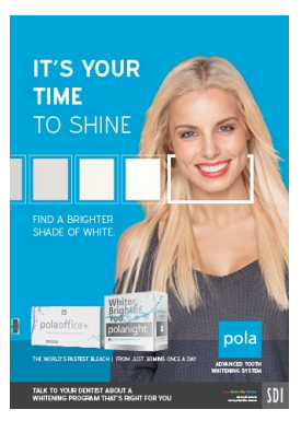
POSTER POLAOFFICE+ AND POLANIGHT Reorder M100281