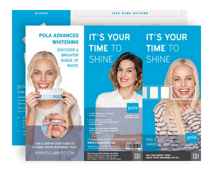
POLA PATIENT HANDOUTS Reorder M100283