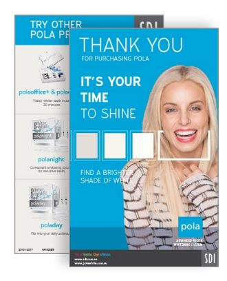
POLA THANK YOU CARD Reorder M100295