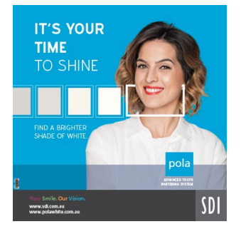
POLA CEILING TILE Reorder M100293