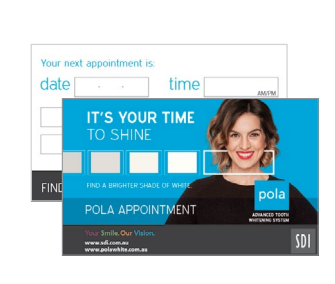
POLA APPOINTMENT CARD Reorder M100287