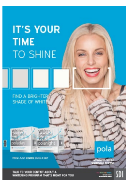
POSTER POLADAY AND POLANIGHT Reorder M100280