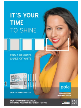
POSTER POLANIGHT Reorder M100275