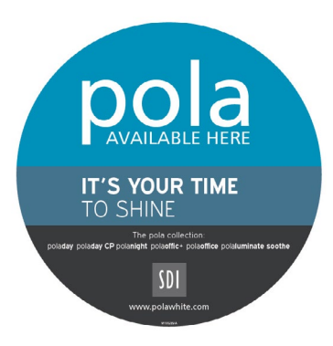
POLA WINDOW STICKER Reorder M100289