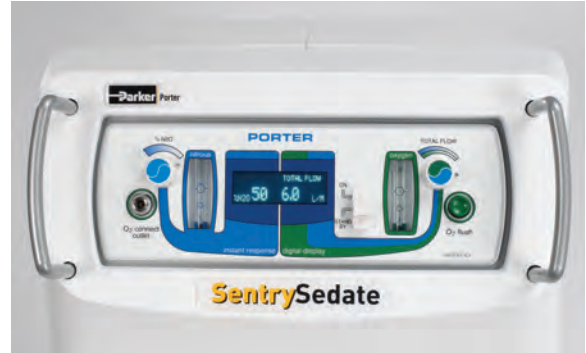
Porter MXR-D Digital and Analog Flowmeter