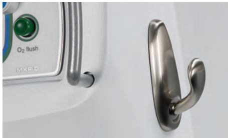
A side hook conveniently holds the breathing circuit and hoses.