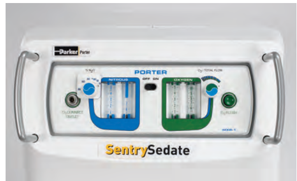
Porter MXR-1 Analog Flowmeter

Porter's newest Nitrous Oxide Sedation System features portability and security with: