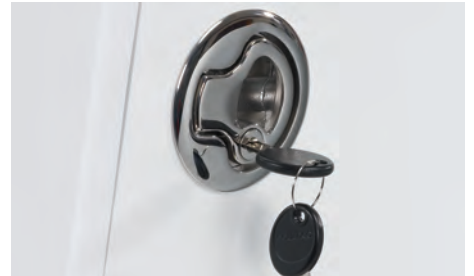
The dual locks ensure safe, secure cylinder storage.