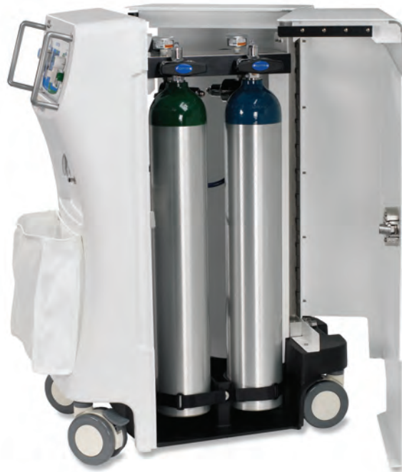
Sentry Sedate holds two nitrous oxide cylinders and two oxygen cylinders.