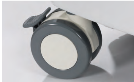
Large locking wheels allow the unit to be easily moved from room to room.