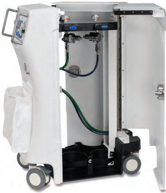
The sturdy cabinet design features both internal and external storage.