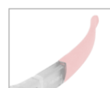
Soft rubber temple tips