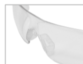
Integrated comfortable nose bridge