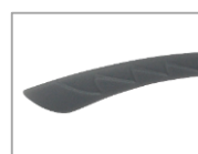
Soft rubber temple tips