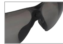
Integrated comfortable nose bridge