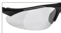
Full 50mm diameter magnifying lens