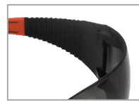
Short temples for secure & broader facial fit