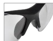
Integrated comfortable nose bridge