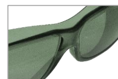
Built-in comfortable nose bridge

For more information, visit palmerohealth.com , call 800.344.6424 or email customerservice@palmerohealth.com .