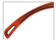
Soft temple tips