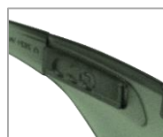
Adjustable temples to fit broader facial