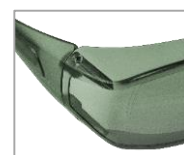
Fully integrated top, bottom & side shields protection