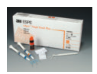
3M<sup>™</sup> ESPE<sup>™</sup> Adper<sup>™</sup> Single Bond Plus Intro Kit