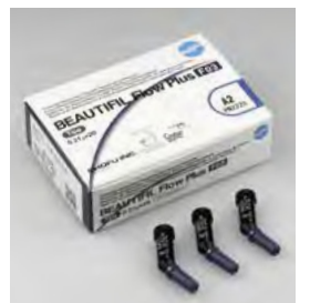
F00 - absolutely stable (Zero Flow)