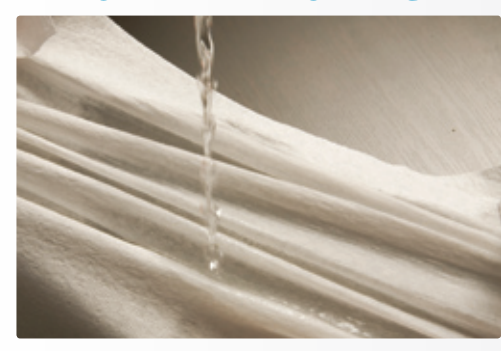
Noted for their superior wet strength, TIDI Washcloths will not deteriorate during use.