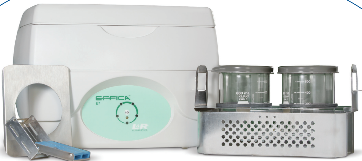
Shown with optional accessory kit