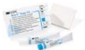
RelyX™ Temp NE Cement: 56660

RelyX temporary cements are available in both eugenol and non-eugenol formulas.