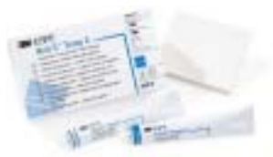
RelyX™ Temp E Cement: 35014