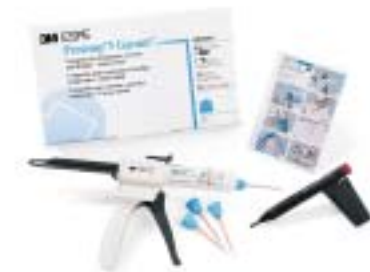
Introductory Kit: 46943

Protemp™3 Garant™ Temporization Material from 3M ESPE is a smart partner for RelyX Temp NE temporary cement and RelyX Temp E temporary cement. Use Protemp3 Garant temporization material to fabricate custom-made temporary restorations that offer superior strength, optimal fit, outstanding esthetics (5 shades), and biocompatibility. That means fewer broken temporary restorations and fewer unscheduled office visits. It's ideal for crowns, bridges, inlays/onlays and veneers.