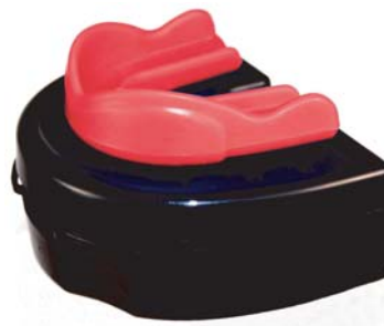
Large Red SSD Pre-Formed Mouthguard

62979 Small Neon Yellow SSD Pre-Formed Mouthguard