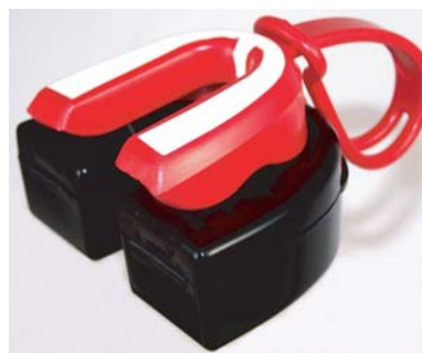
Large Red PLUS Pre-Formed Mouthguard

62989 Small Yellow PLUS Pre-Formed Mouthguard