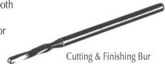
Cutting & Finishing Bur

Item # Description 20000 Cutting & Finishing Bur for Thermoplastic Materials, HP