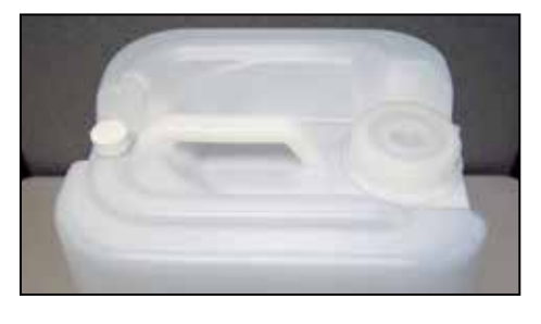
1. Set container upright with the handle facing the ceiling.

Due to the rigidity of the container, the small vent may be difficult to puncture. DO NOT use curved sharp items such as lab knives to puncture.