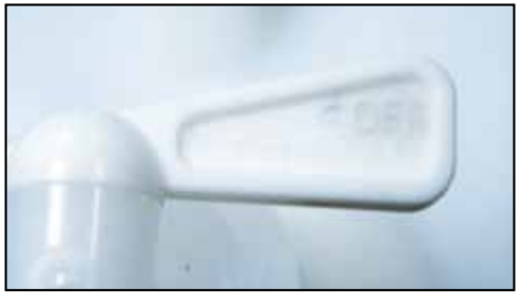
5. Check to ensure spigot is in the "OFF" position.