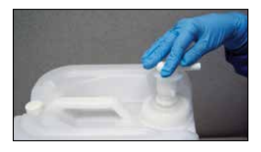
4. With the handle still facing the ceiling, screw the spigot tightly into the large cap.