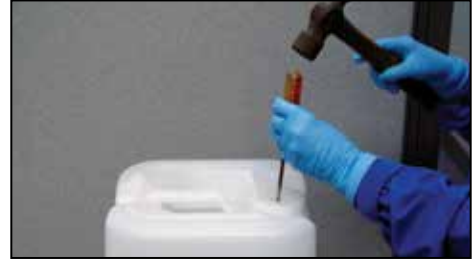
2. Use screwdriver and hammer to puncture the indentation at the center of the large cap. (Do not attempt to remove cap.)