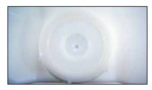
The puncture should be large enough to allow liquid to flow after the spigot is installed. If needed, puncture additional holes.