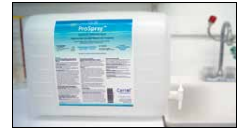
6. Position in dispensing location with spigot pointing towards floor. Turn spigot to OPEN position to dispense product.