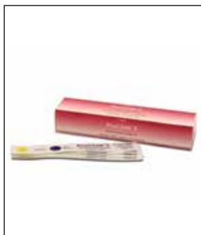
ProChek® S Steam Sterilization Integrator