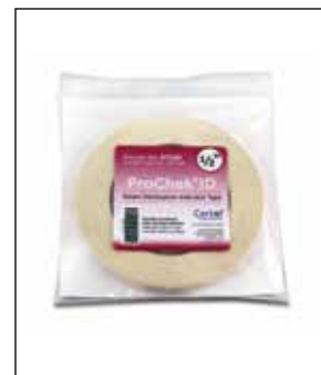
ProChek® ID Indicator Tape