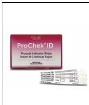
ProChek® ID Indicator Strips for Steam and Chemical Vapor