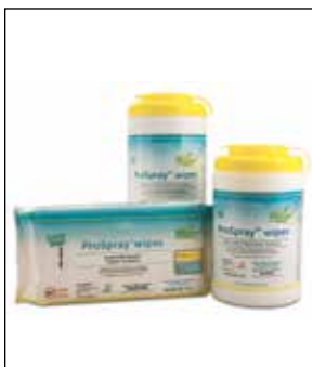
ProSpray™ wipes Surface Disinfectant/ Cleaner Towelettes

Other products available from Certol include: