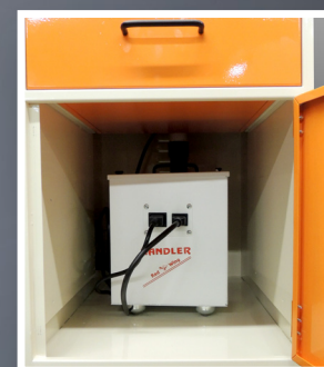
550A Dust Collector Storage