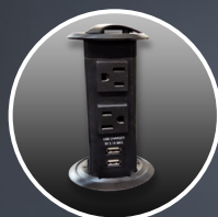
Pop-up duplex power supply with 2 USB ports