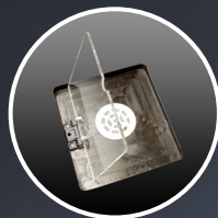
Down Draft Dust Collection Portal with Shield