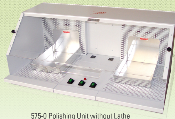
575-0 Polishing Unit without Lathe

OVER 90 YEARS OF AMERICAN-MADE DURABILITY IN DENTURE PROCESSING EQUIPMENT