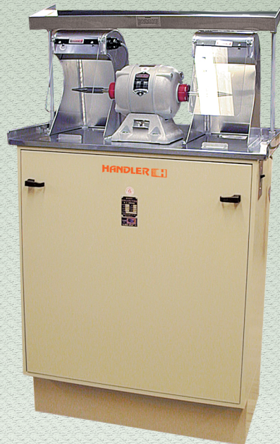
75D-FC POLISHING GRINDING UNIT