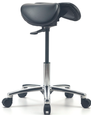
Brewer 135DSS Dynamic Split-Saddle-Seat Technology