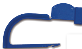
Tamper Evident Seal for Latch

Disposable Paper Filter 100 pieces, blank, single use | IMCO-FIL3M