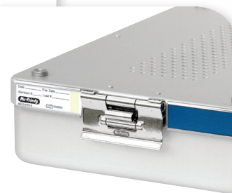
Container Indicator Card

Visit us online at Hu-Friedy.com/SterilizationContainers