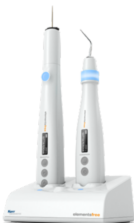
Dual Charging Base

n., Powered obturation with no strings attached