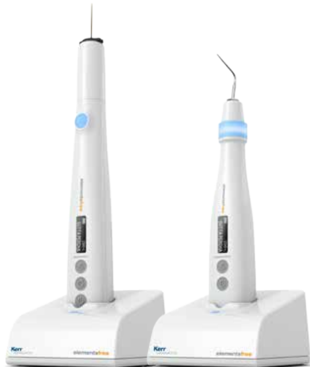
Single Charging Base