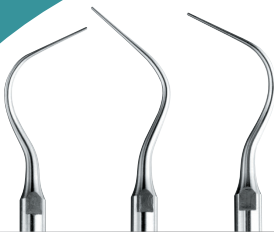
AFTER FIVE RIGHT (USAFR) | AFTER FIVE STRAIGHT (USAFS) | AFTER FIVE LEFT (USAFL)

Try our probe sized tips which are designed to enhance access into periodontal pockets and improve adaptation in interproximal areas, allowing you to more thoroughly debride difficult to reach areas to achieve better clinical results.