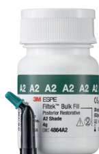
Filtek™ Bulk Fill Posterior Restorative

And, it helps you deliver predictable, robust outcomes. All you need is the new RelyX™ Fiber Post 3D Glass Fiber Post plus three other easy-to-use 3M products: RelyX™ Unicem 2 Automix Cement, Scotchbond™ Universal Adhesive, and Filtek™ Bulk Fill Posterior Restorative. These four products have one common objective: Simplify the complex!