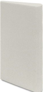
No. 6A Arkansas Thick Wedge | SS6A Hard Fine Grit Rounded edges for optional contouring. 4" x 1-7/8" x 3/8" down to 1/8"