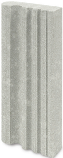
No. 5 Arkansas Bates | SS5 Hard Fine Grit Channeled stone for use with explorers, scalers, carvers and disc-shaped instruments. 4" x 1-1/2" x 1/2"