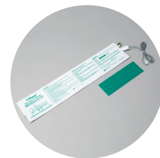
8317 LOW AIR LOSS SENSORS