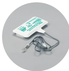
8332 TOILET SENSORS