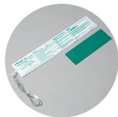
8316 STRETCHER SENSORS