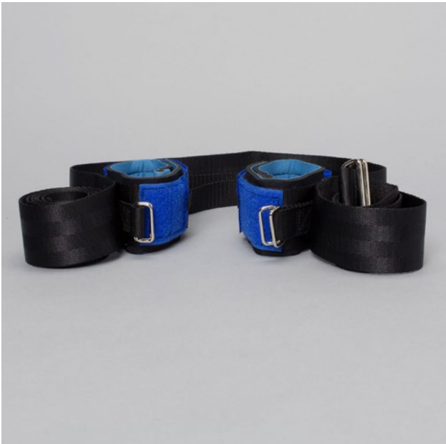
2796 | Connected Wrist, Stretcher