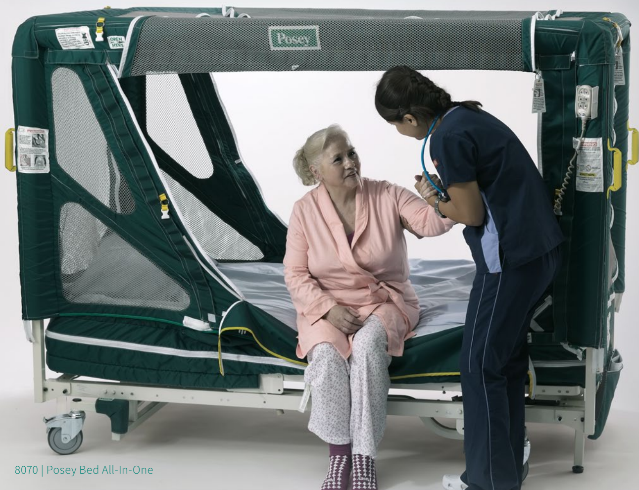
8070 | Posey Bed All-In-One

The Posey Bed is a patented bed enclosure system and is a less restrictive restraint alternative to physical restraints such as belts, vest, or jackets. The Posey Bed helps to reduce the risk of unassisted bed exits and patient falls and provides a safe patient environment.