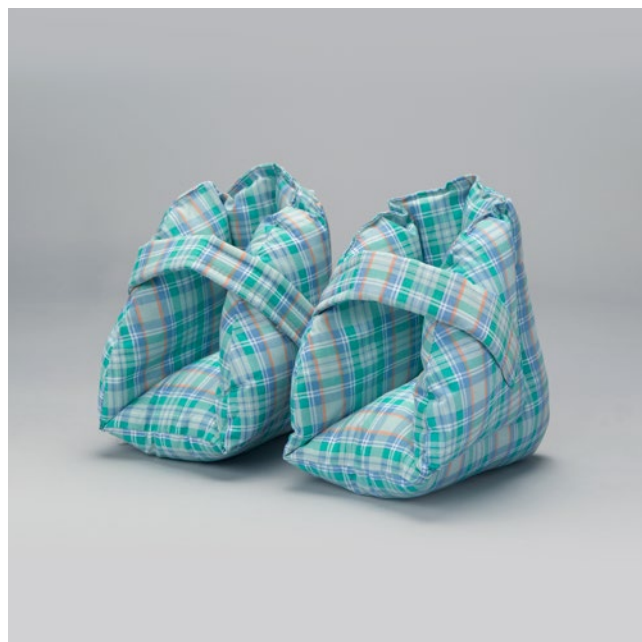
6115 | Posey Quilted Heel