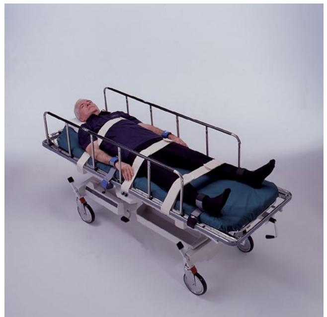
5550 | Posey General Purpose