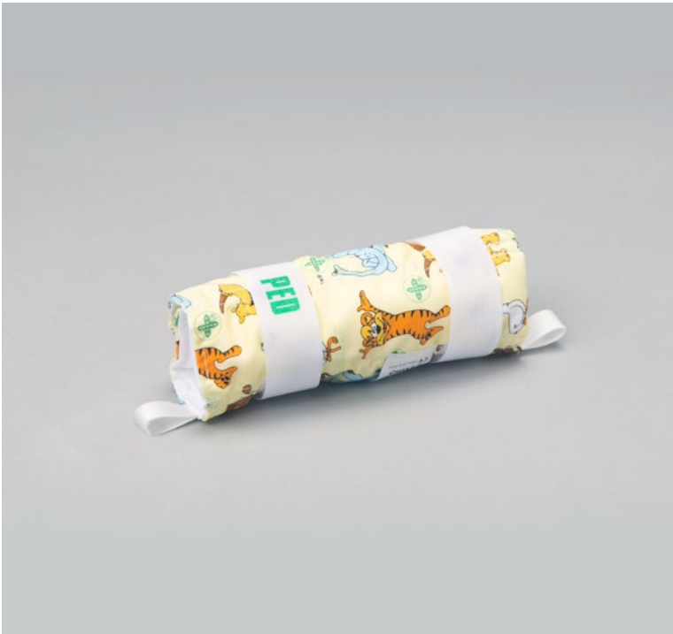
8168P | Pediatric