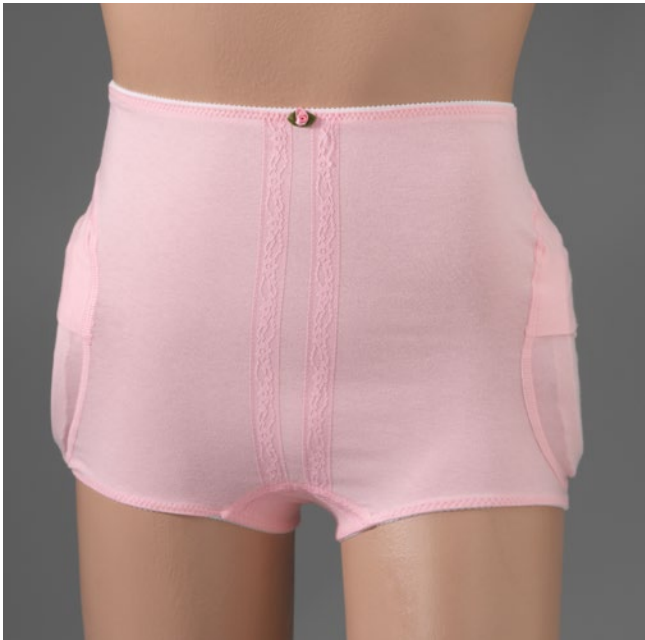
6030XL | Ladies' Community Hipster Removable Pads