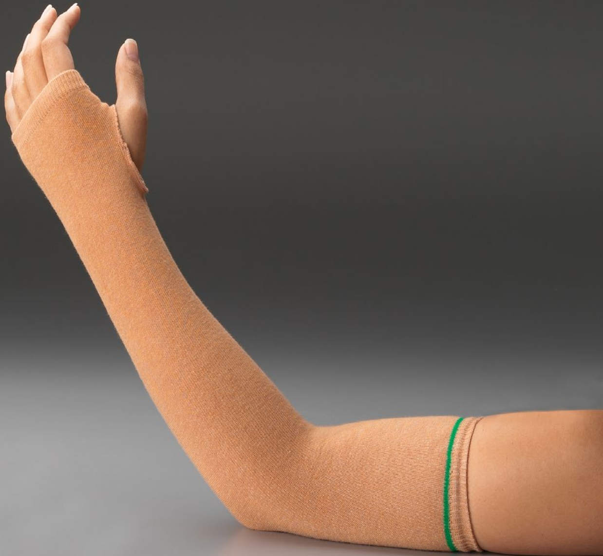
6000 | Skin Sleeves Arm-Medium