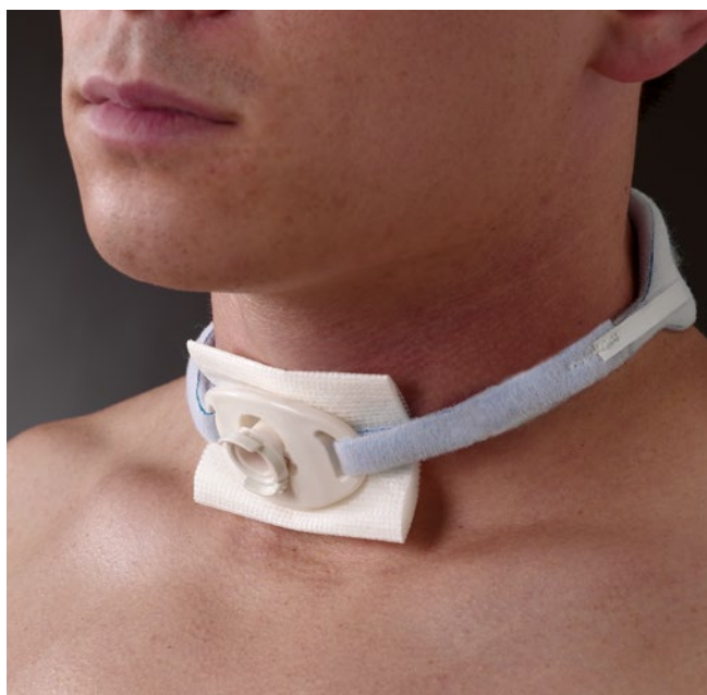
8197M | Posey Foam Trach Ties