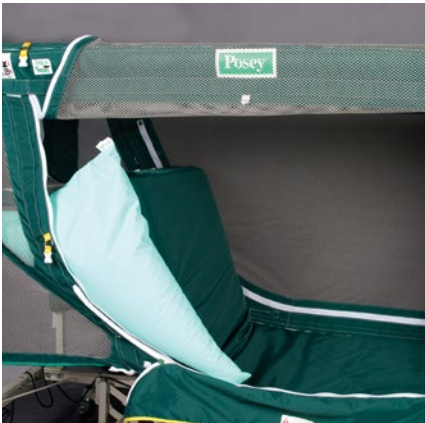
8021 | Posey Bed Filler Cushions