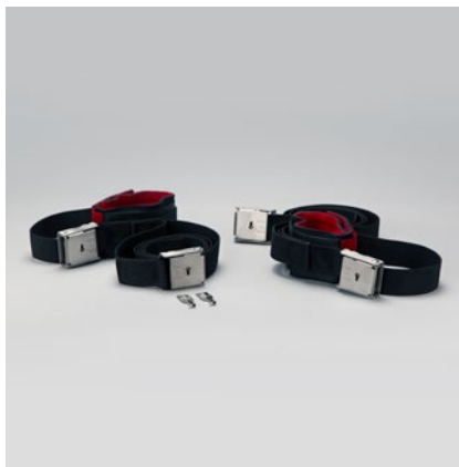
2799 | Double Locking