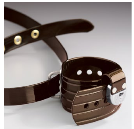
2900 | Biothane Cuff