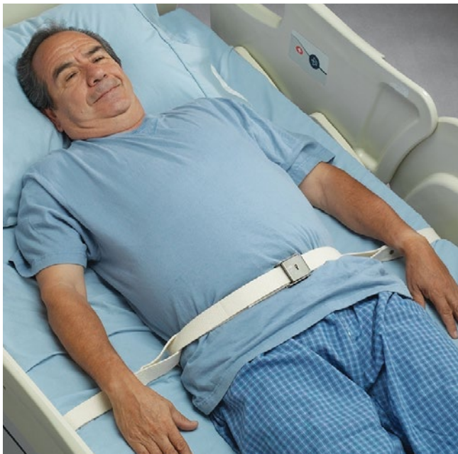
1337 | Posey Swedish Belt

The Posey Key Lock Belt allows the patient to sit up or move from side to side in the bed. The interlocking harness helps prevent the patient from sliding out of the belt.