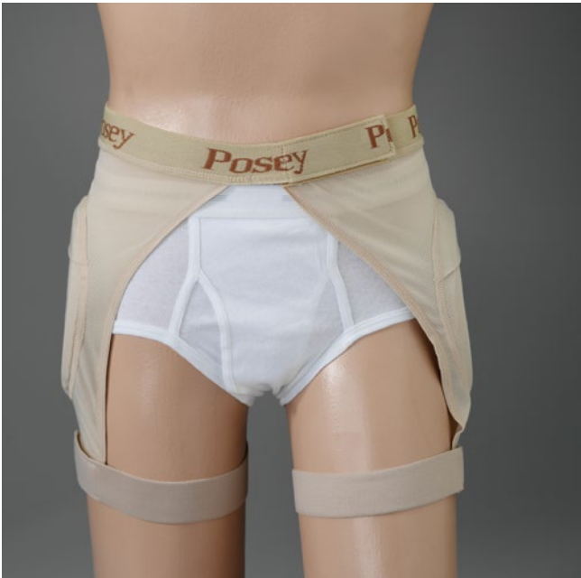
6019S | EZ-On Brief Removable Pads