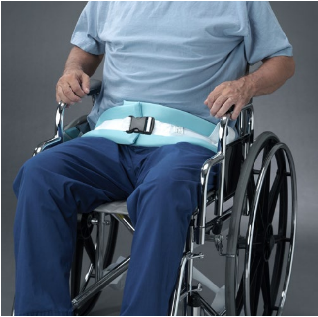
4126Q | Padded belts