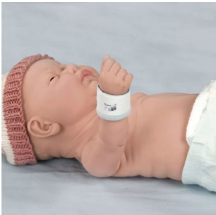
4648 | Posey Movable ID Bracelets, Newborn