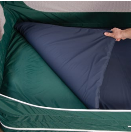
8007 | BCS Mattress Pad