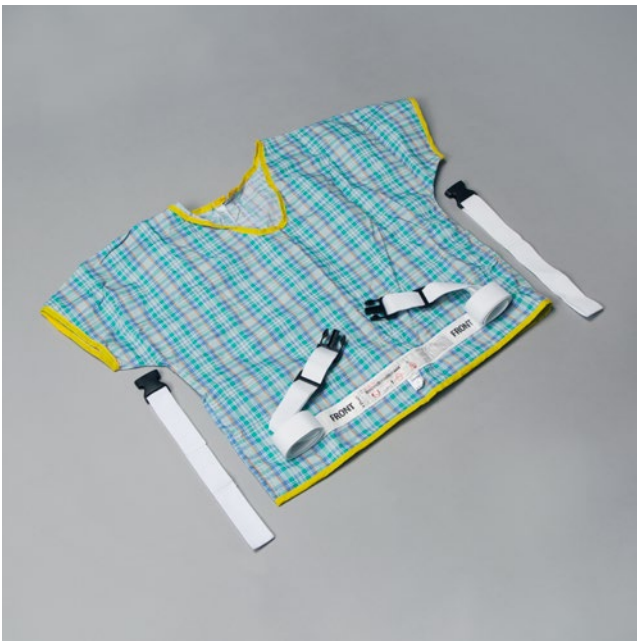
3060 | Posey Safety Vest

The Posey Safety Vest is for patients at risk for falls or those requiring a restraint to assist with medical treatment. The safety vests are sleeveless restraints that help prevent unassisted bed or chair exits.