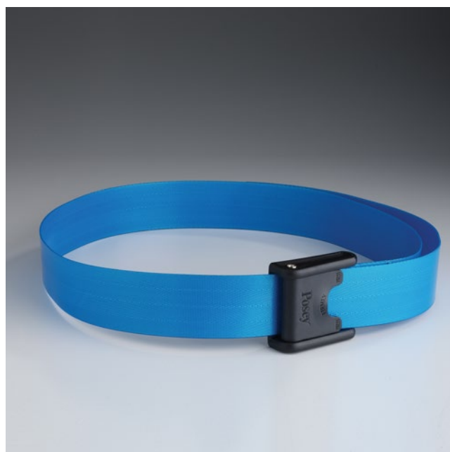
6546B | EZ Clean Gait Belt, Blue