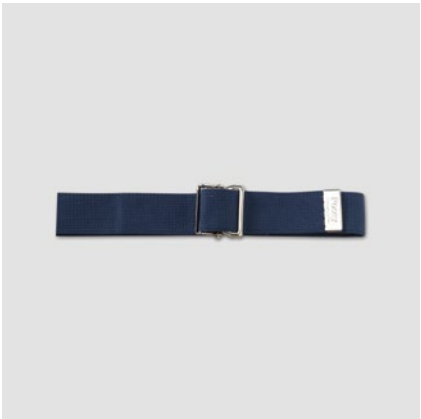
6528 | Gait Belt, Navy