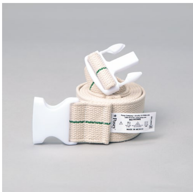
6556Q | Quick-Release Belts