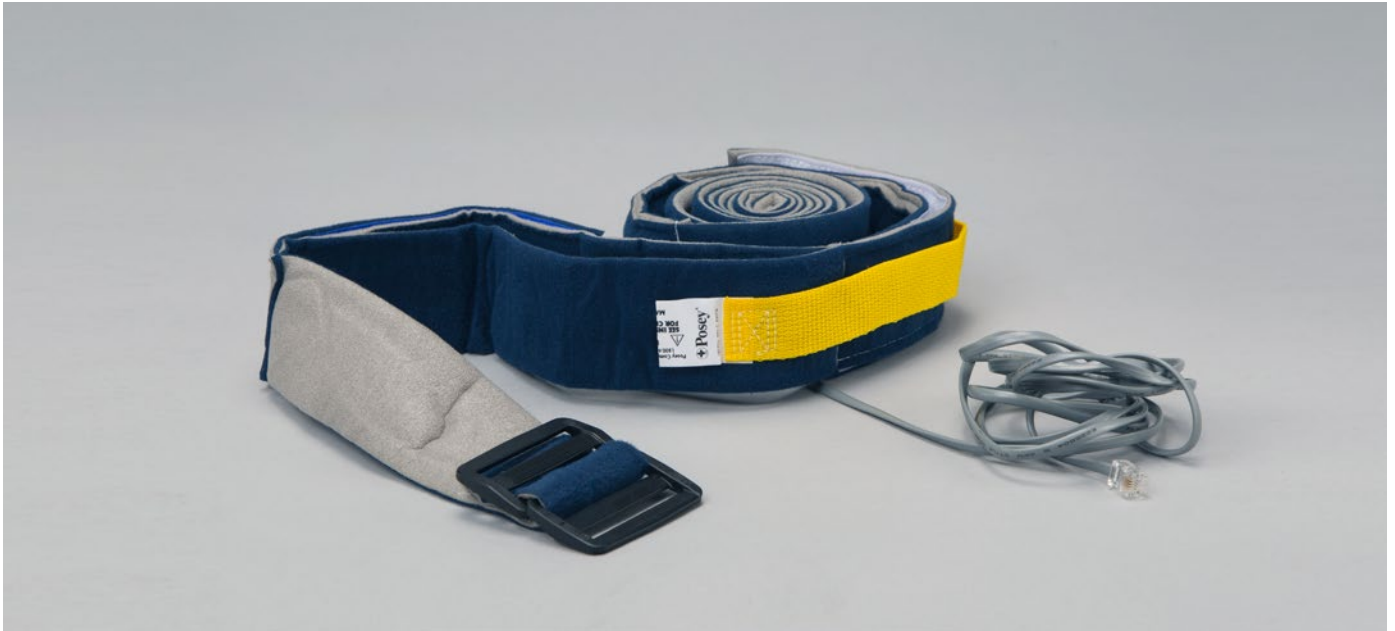
8399 | HeadStart® Notification Chair Sensor