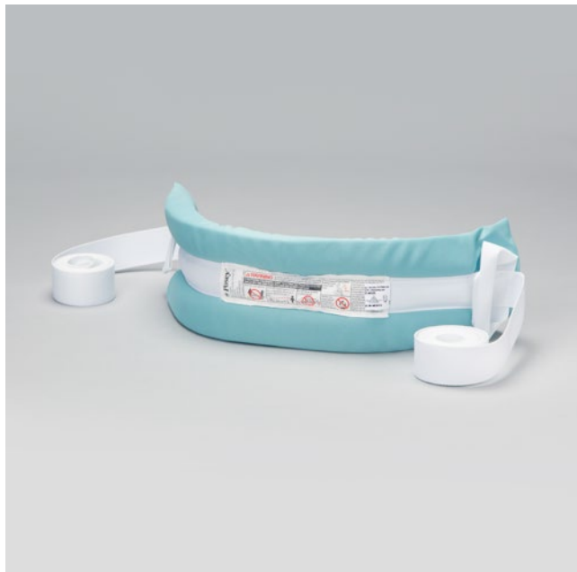
4125 | Posey Soft Belt w/Ties