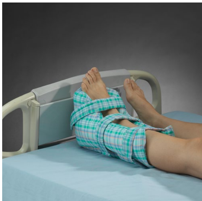
6113 | Quilted Long Boot, Plaid