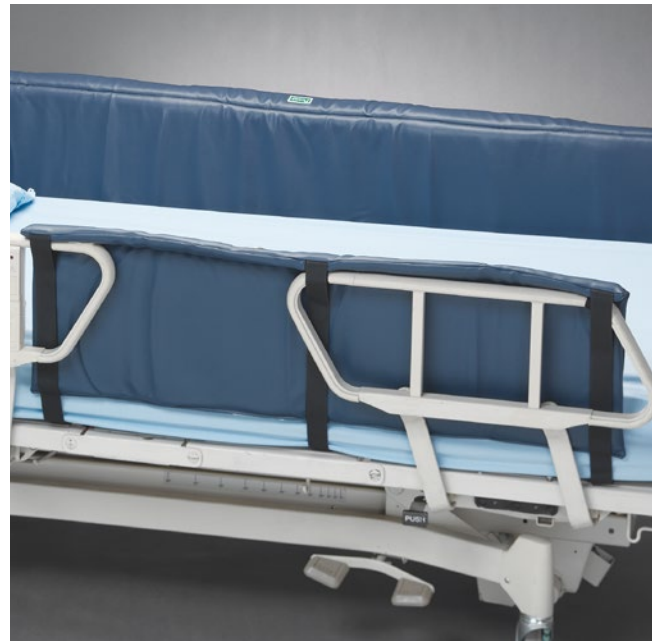
5607 | Deluxe Guard Rail Pads - 43"