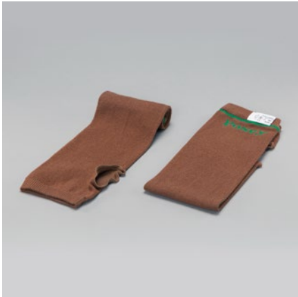
6003S | Posey Skin Sleeves Arm Dark - Small