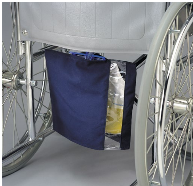
8215 | Urine Drainage Bag Holder/Cover Canvas with Straps