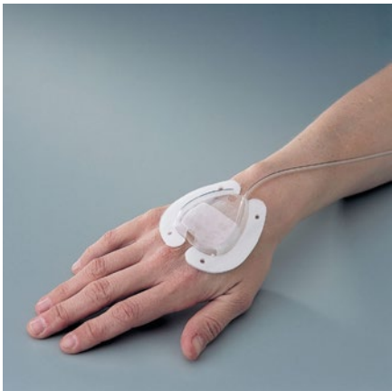
8141 | Posey IV Shield

Posey offers several products to help monitor and protect pediatric patients.