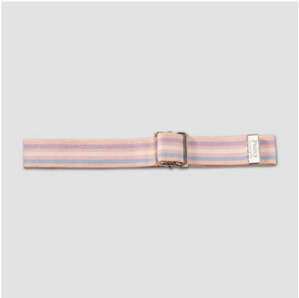
6531 | Gait Belt, Pastel