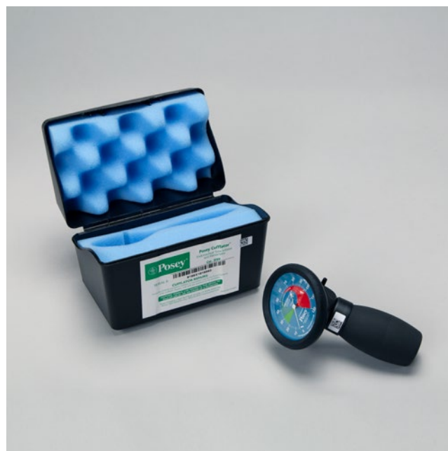
8199 | Posey Cufflator™