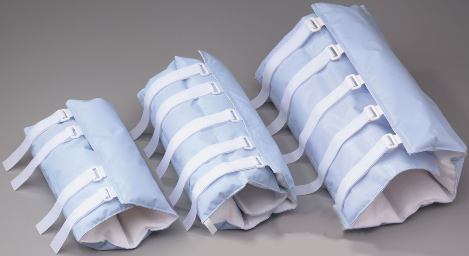
8168S, 8168M, 8168L | SecureSleeves