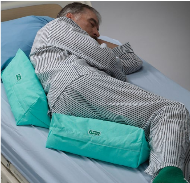
6309M | Lateral Wedge, Medium