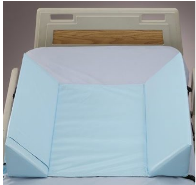
5700 | Roll Guard