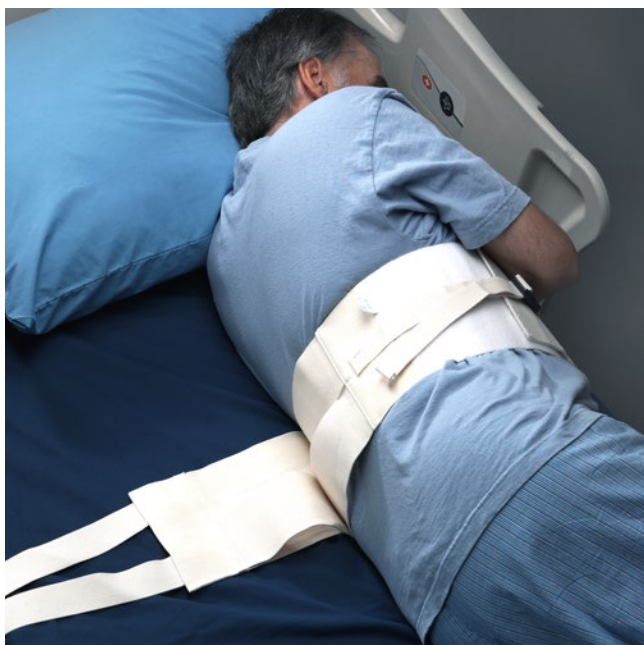
1135 | Posey Self-Releasing Roll Belt

Posey Self-Releasing Belts help reduce the risk of forward sliding and act as a reminder for patients to ask for assistance with ambulation.