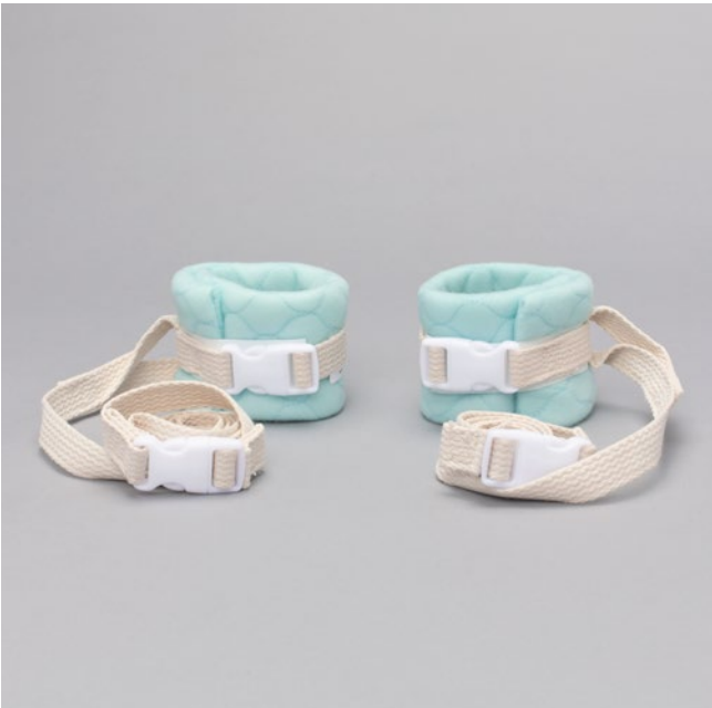
2531 | Double Strap Tie