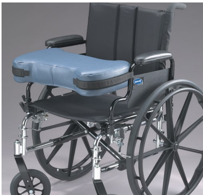
6542 | E-Z Release Hugger