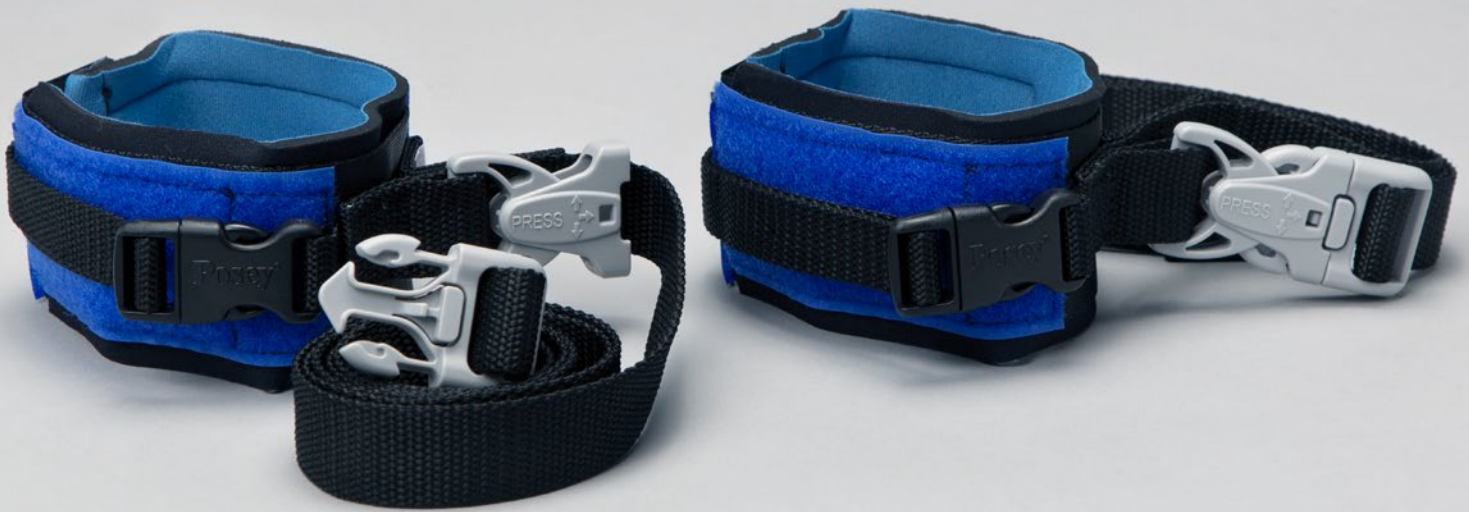
2700Q | Twice-As-Tough Cuffs, Three Point Buckle