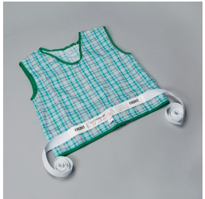
3050 | Posey Safety Vest