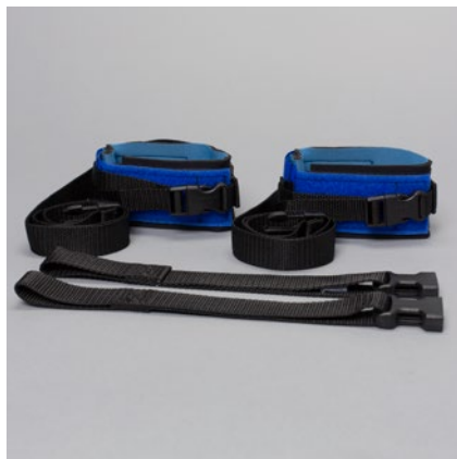
2789Q | Quick-Release Buckle