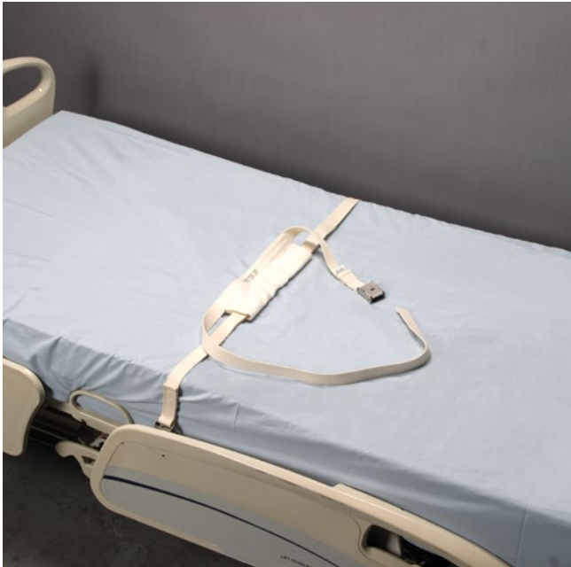
1334 | Posey Key Lock Belt