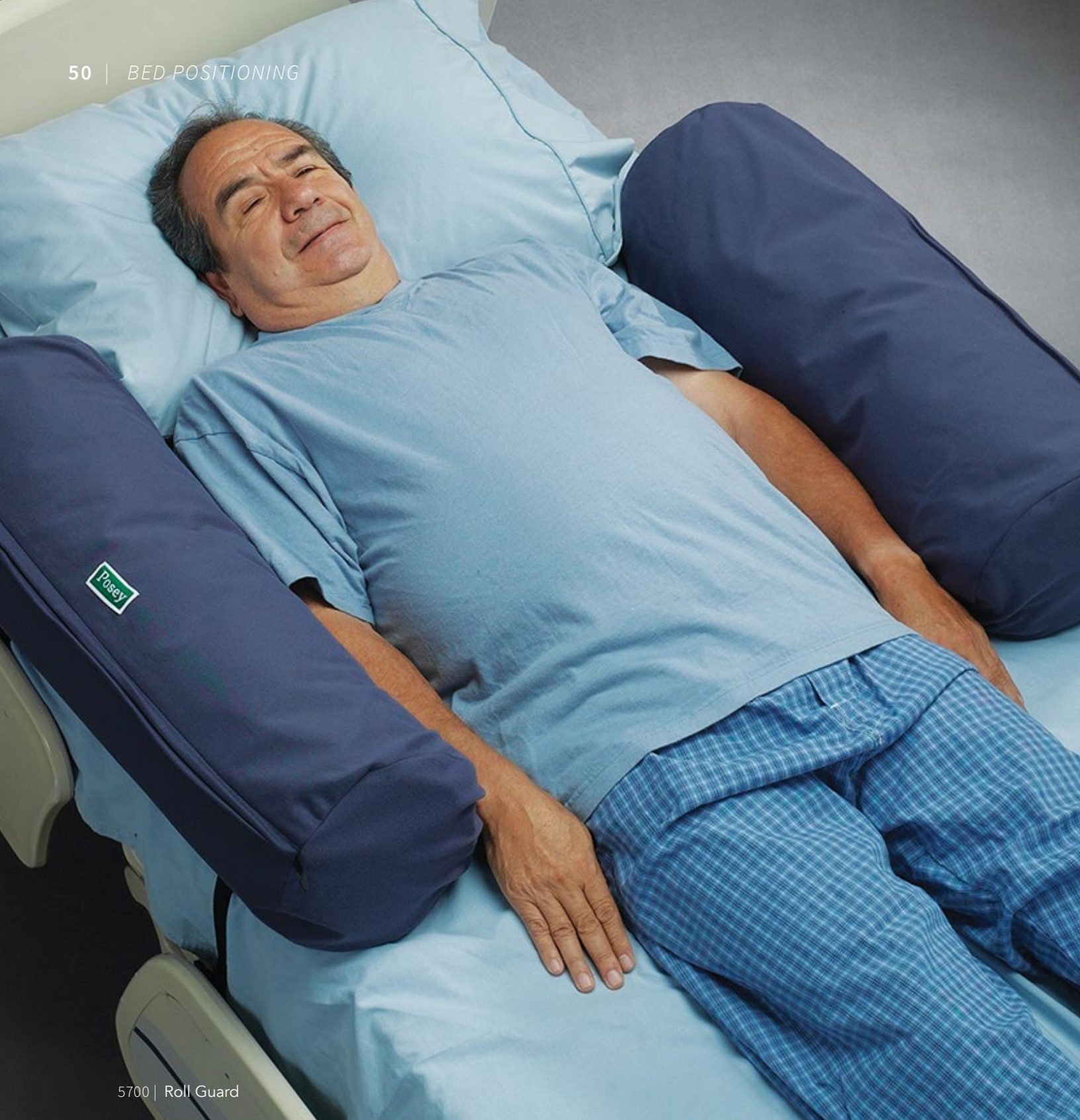
5700 | Roll Guard