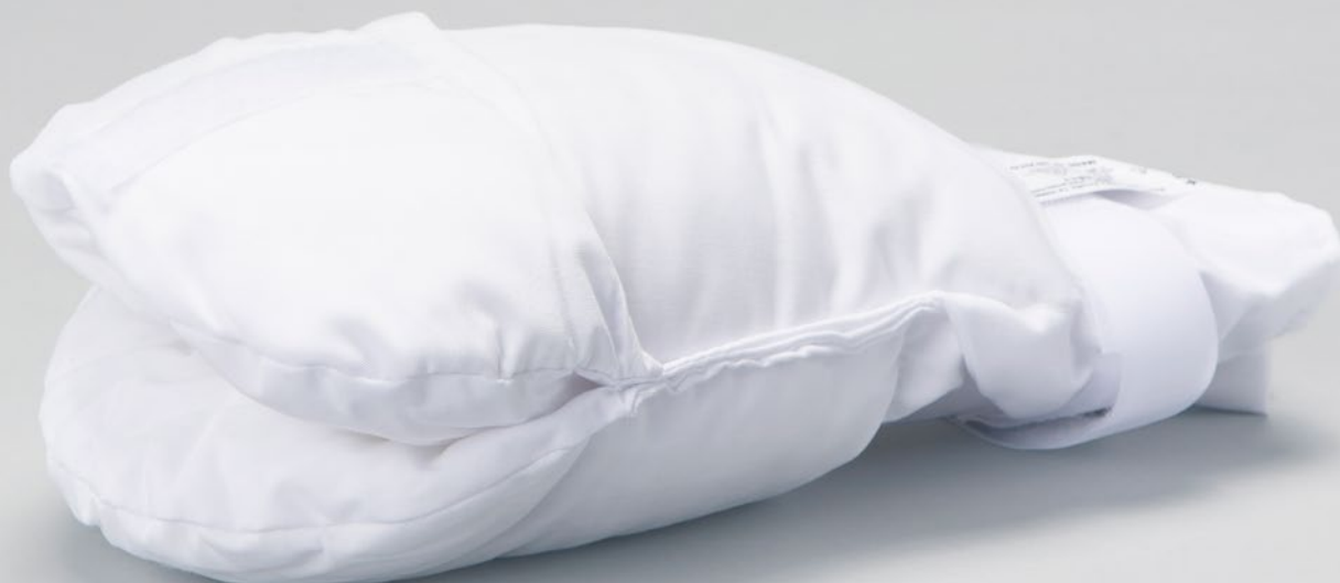
2811 | Peek-A-Boo® Mitt