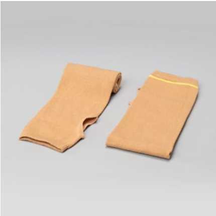
6000 | Posey Skin Sleeves Arm