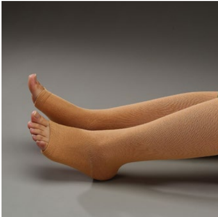
6001 | Posey Skin Sleeves