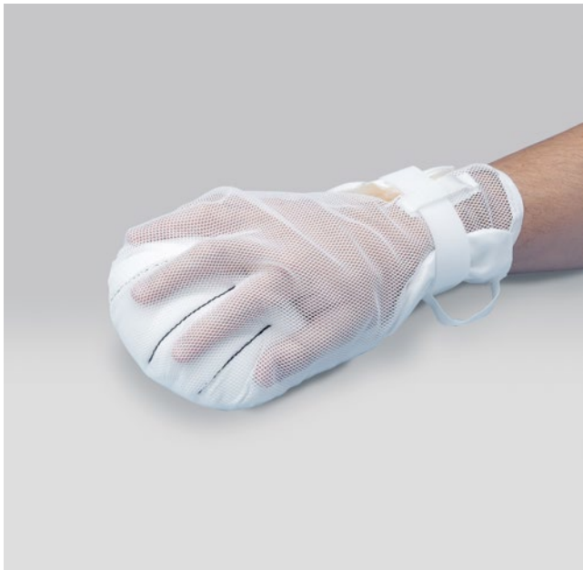
2810 | Diversionary Mitt