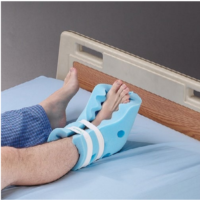
6145 | Posey Premium Heel Guard

The multi-purpose foot boot helps in the prevention of heel and toe ulcers and safeguards against foot drop. Heel guards help isolate the heel to help protect against pressure injuries.