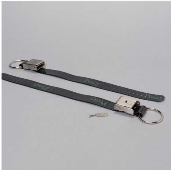
2370 | Universal Anchor Strap