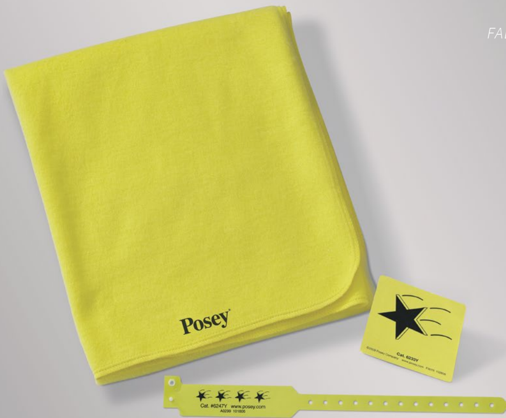
6236Y | Falls Risk Indicators