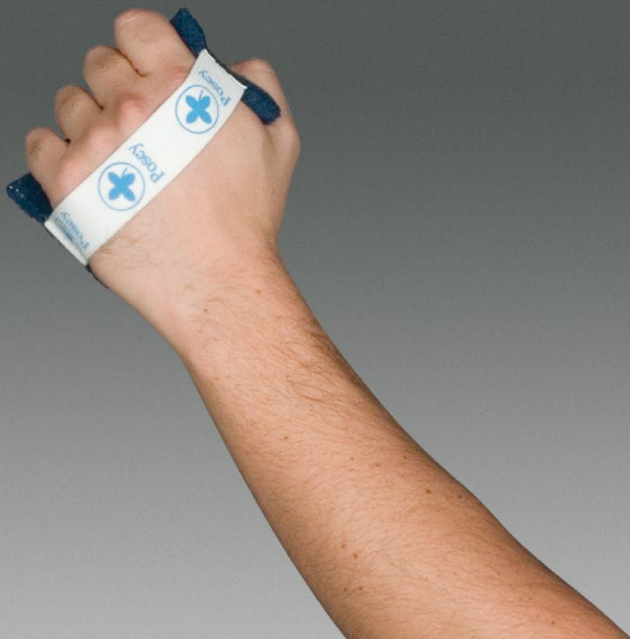
6507 | Posey Palm Grip-Small