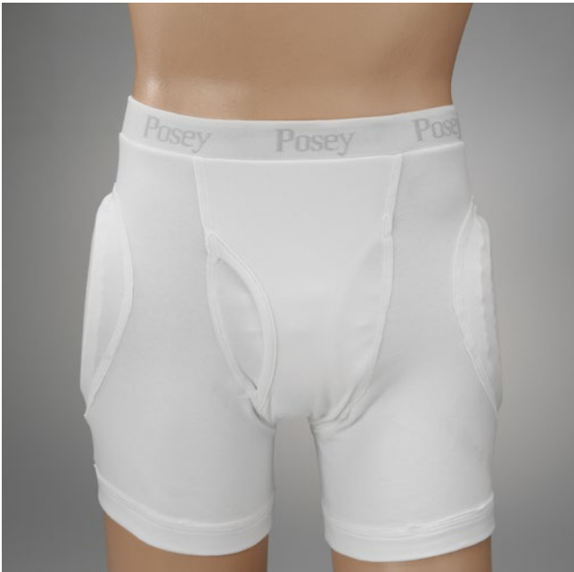
6018M | Male Fly Brief Removable Pads