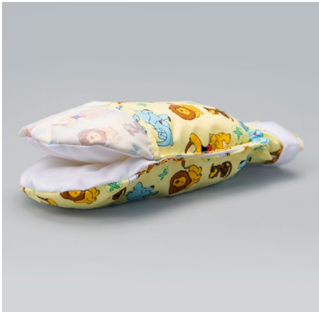
2911M | Peek-A-Boo Mitt, Medium