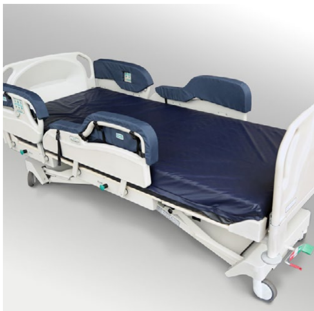
5767 | Spirit Select and Spirit Plus Beds