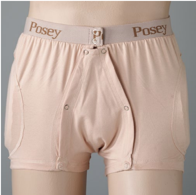
6017L | Incontinent Brief Removable Pads