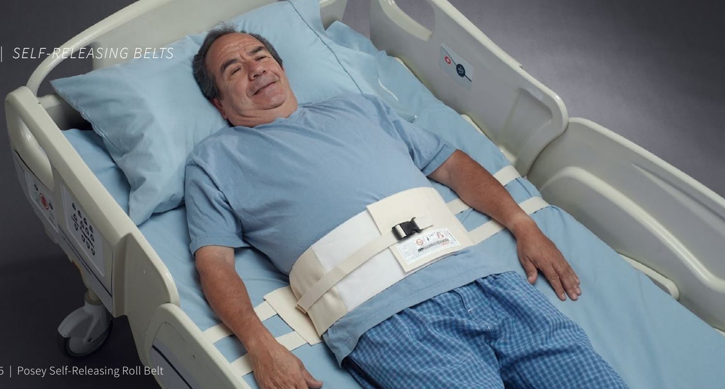
1135 | Posey Self-Releasing Roll Belt