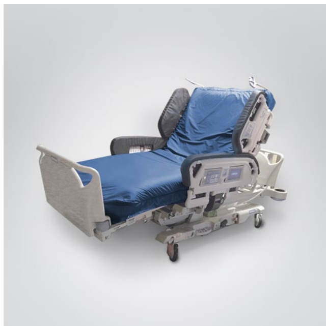
5756 | Progressa ICU Beds