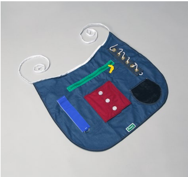
7400 | Posey Activity Apron