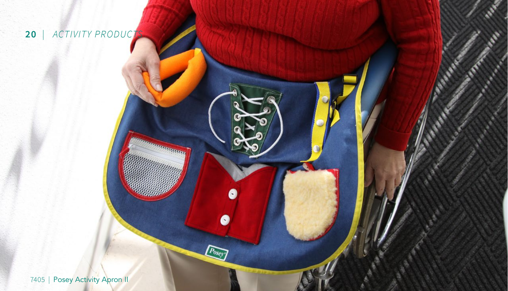
7405 | Posey Activity Apron II

Posey Activity Products are designed for patients with diminished cognitive function. The bright colors and texture variation provide visual and tactile stimulation, and the buttons and shoestring treading may aid improvement of fine motor skills.