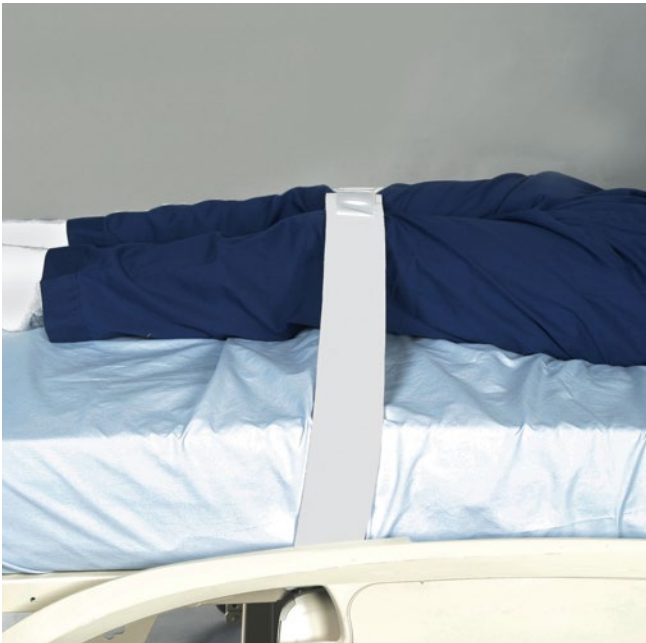
5551 | Disposable Knee and Body Strap