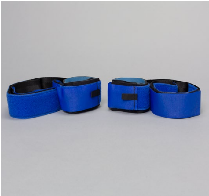
2750 | Stretcher, Regular (Blue)