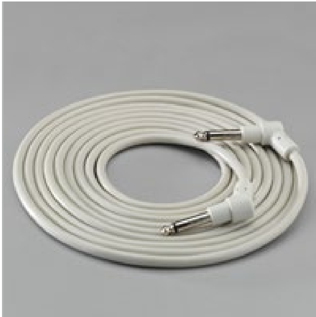
8282 | Posey Nurse Call Cable