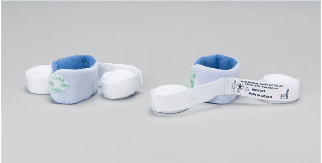
4733 | Infant-2 years