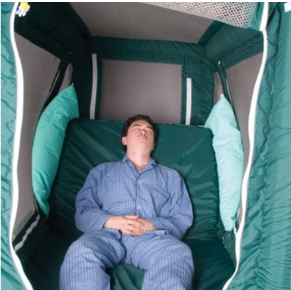
8021 | Posey Bed Filler Cushions