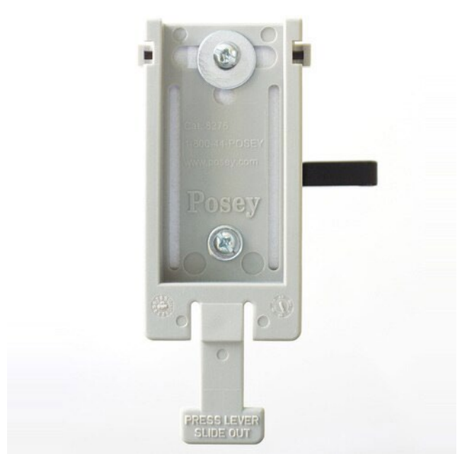
8208H | Posey Alarm Wall Bracket