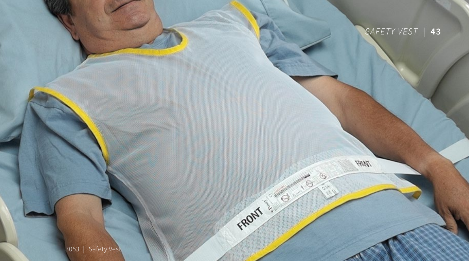
3053 | Safety Vest