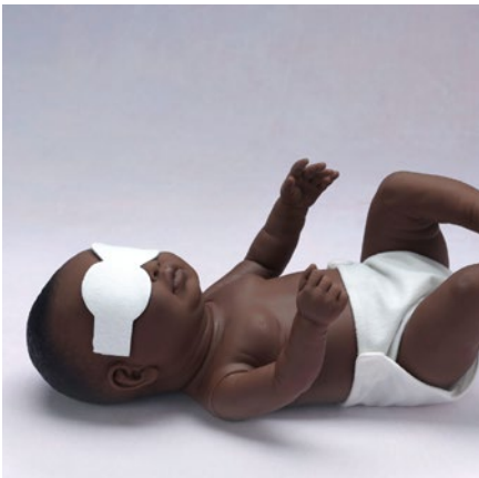
4644 | Posey Eye Protector, Small