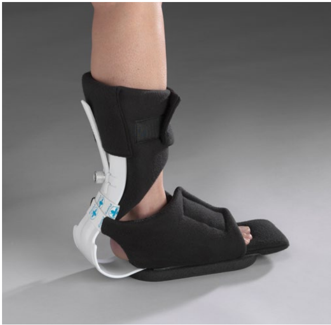
6148SM | Podus w/ Ambulation Sole