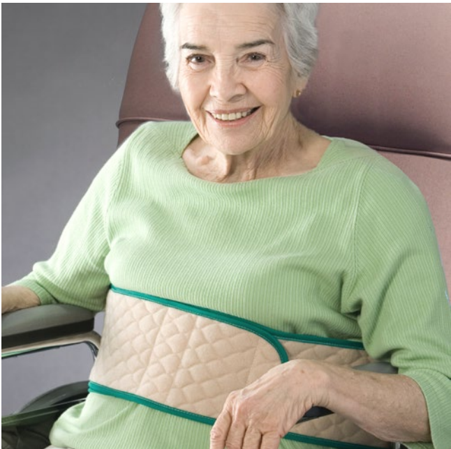
3658L | Posey Self-Releasing Wrap-Around