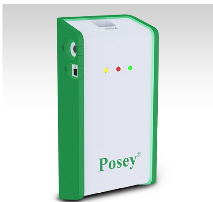
8621 | Wireless Transmitter