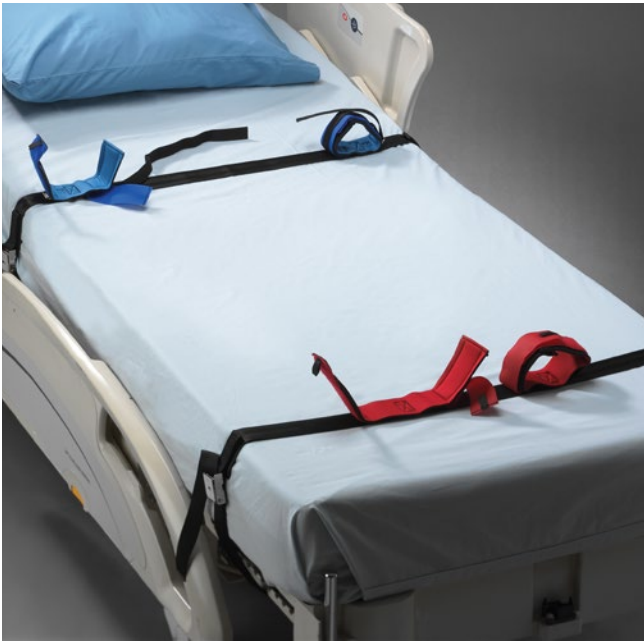
2794 & 2795 | Connected Twice-as-Tough Cuffs, Bed