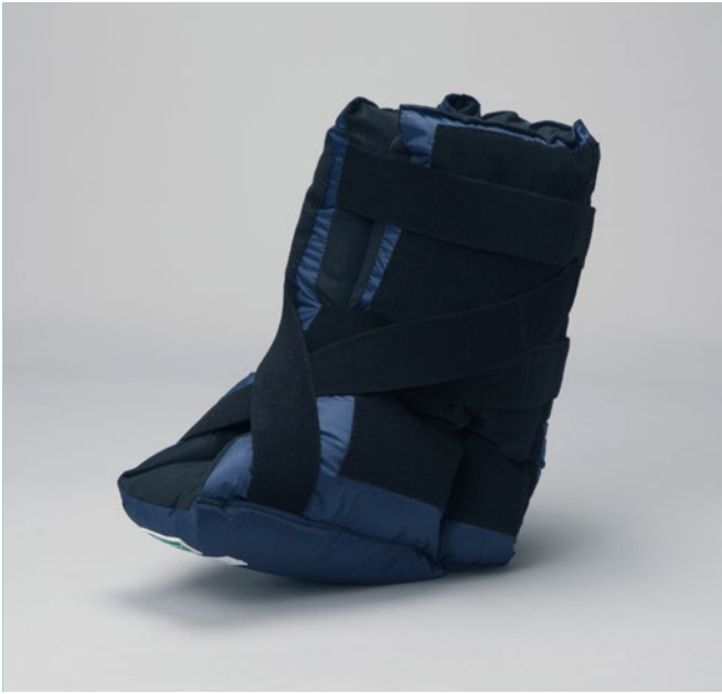
6128 | PRO-heeLx Heel Protector