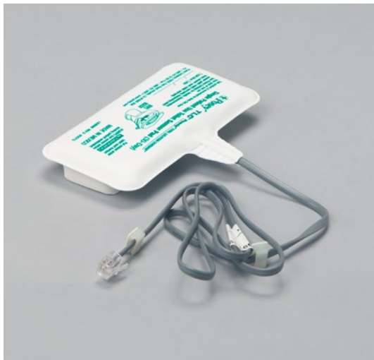
8332 | Toilet Seat Sensor