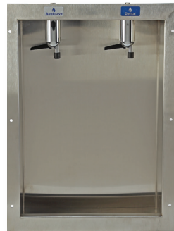
Remote Dispensing Sink (optional)