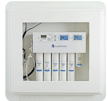
In-Wall Cabinet (optional)