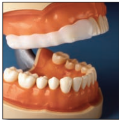
Insulate sensitive teeth