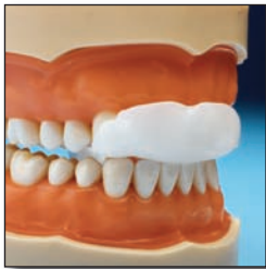
Anterior bruxing appliance