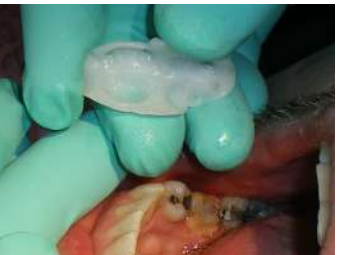
Matrix removed after cooling