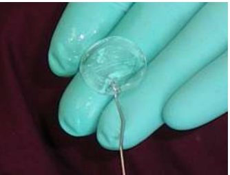
CLEAR Button removed after heating