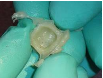
Removal/trimming of any flash, finishing. NO Polishing Necessary