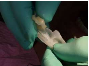
Removal of temporary crown from matrix, after fully set