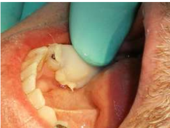
Insertion of the filled matrix