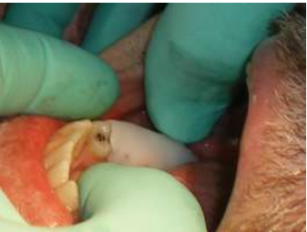
Placement of the button over the prepared tooth, or abutment teeth. SPRAY WITH COLD AIR