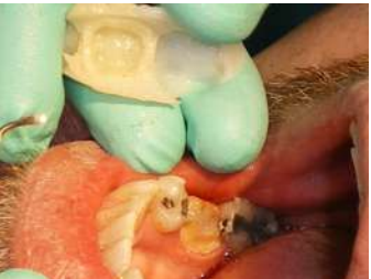
Matrix with temporary crown removed