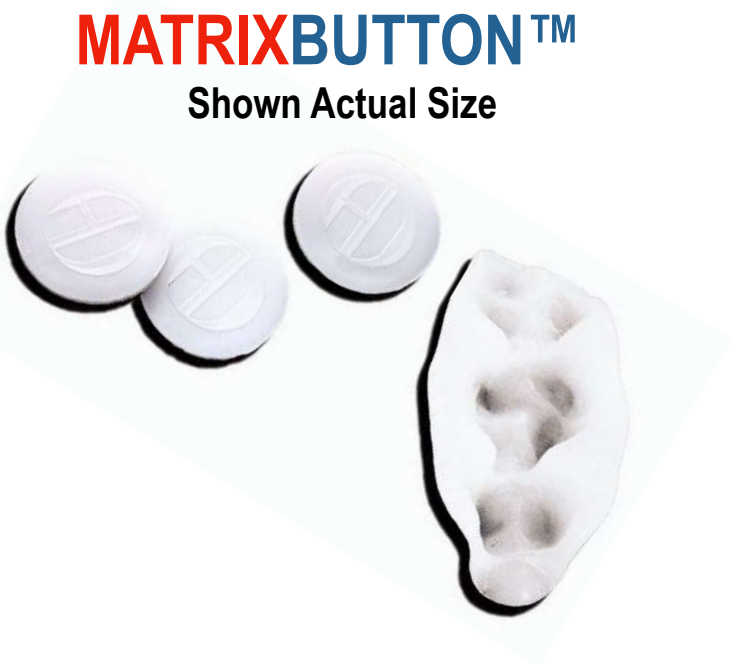
MATRIXBUTTON™ Shown Actual Size

MatrixTemp is a 1:1 auto-mix product used in the standard “gun”. It can also be extruded and hand-mixed and placed. The higher viscosity may require more “grip” than some other brands, but the clinical results are worth it.....Read on!