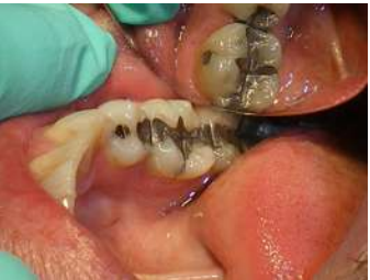
Pre-preparation operative field