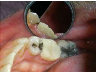
Seating of the temporary crown,- adjustments, if any