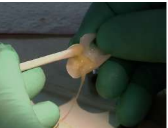
Loading of MatrixTemp into the matrix