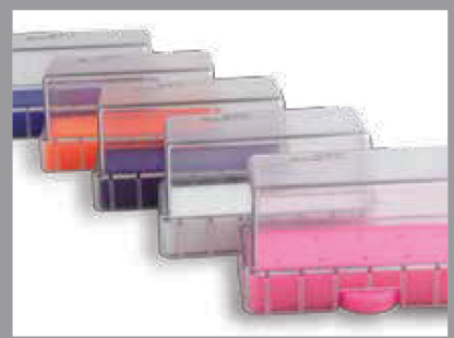
Assorted colors for practice organization