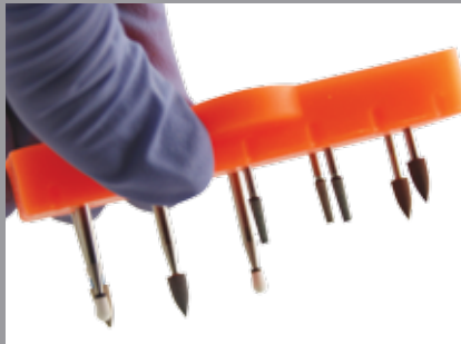
Mix and match burs – holds FG, CA, and short shank