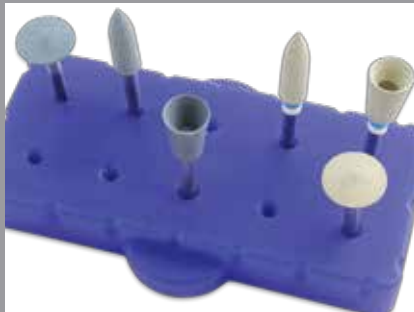
Resists high temperature and distortion