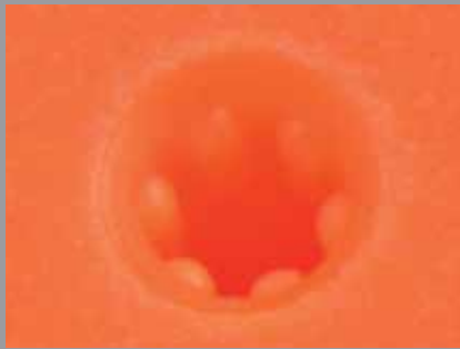
Patented starburst hole design