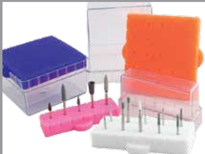
Assorted colors and sizes for practice organization