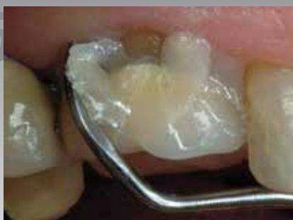
Five: Remove excess and polish margins of the crown.