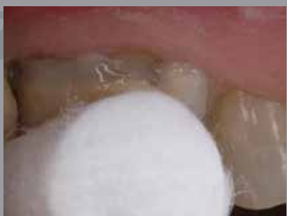
Three: Apply occlusal pressure.