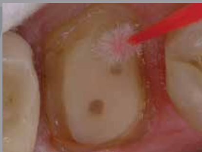
One: Clean, isolate and moisten prepared tooth.