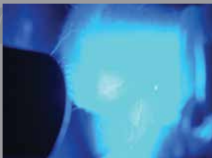
Four: Light cure, maintaining occlusal pressure.