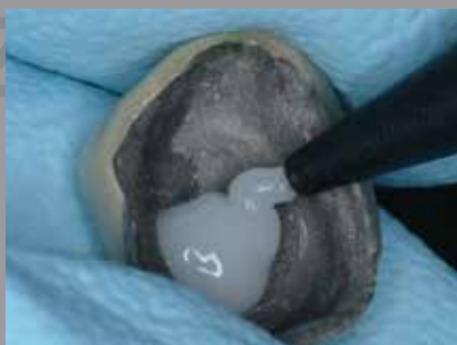
Two: Inject MonoCem into crown and seat on tooth.