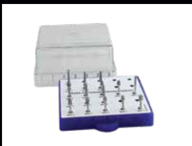
QUICKLY PREP TEETH