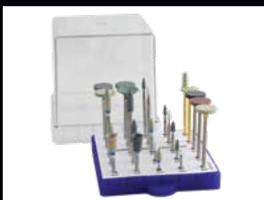
CONTOUR, FINISH, AND POLISH