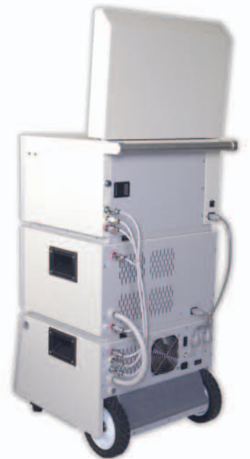
Aseptic design for easy maintenance.