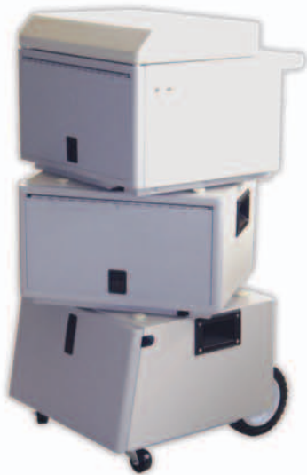
Modular design for ease in transportation.