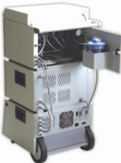
Convenient access to internal utilities.